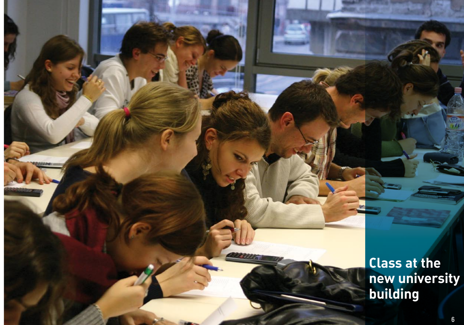
Class at the new university building

The Royal University of Groningen, The Netherlands and Corvinus University of Budapest have decided to award a double degree in International Economy and Business to those students who are willing to spend a minimum of one semester at the partner university and obtain a required level of credits. Students can apply for Erasmus/Socrates scholarship and the Dutch HSP scholarship. Double degree and scholarship are provided on a competitive basis.